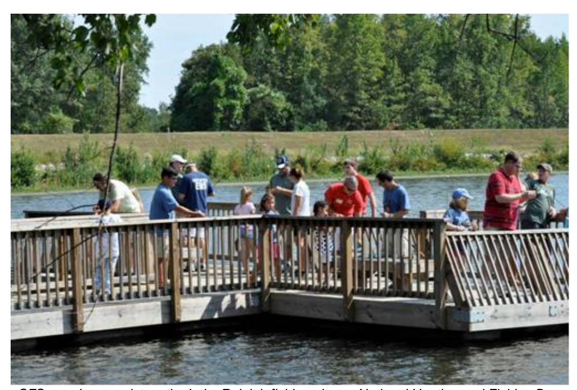
SFS members assist on the Lake Raleigh fishing pier on National Hunting and Fishing Day.

Service and outreach has always been and continues to be a focal point of SFS. We had a lot of fun teaching children how to cast a fishing rod by using the "Backyard Bass" game and actually catching fish from Lake Raleigh for the National Hunting and Fishing Day sponsored by the NC WRC.