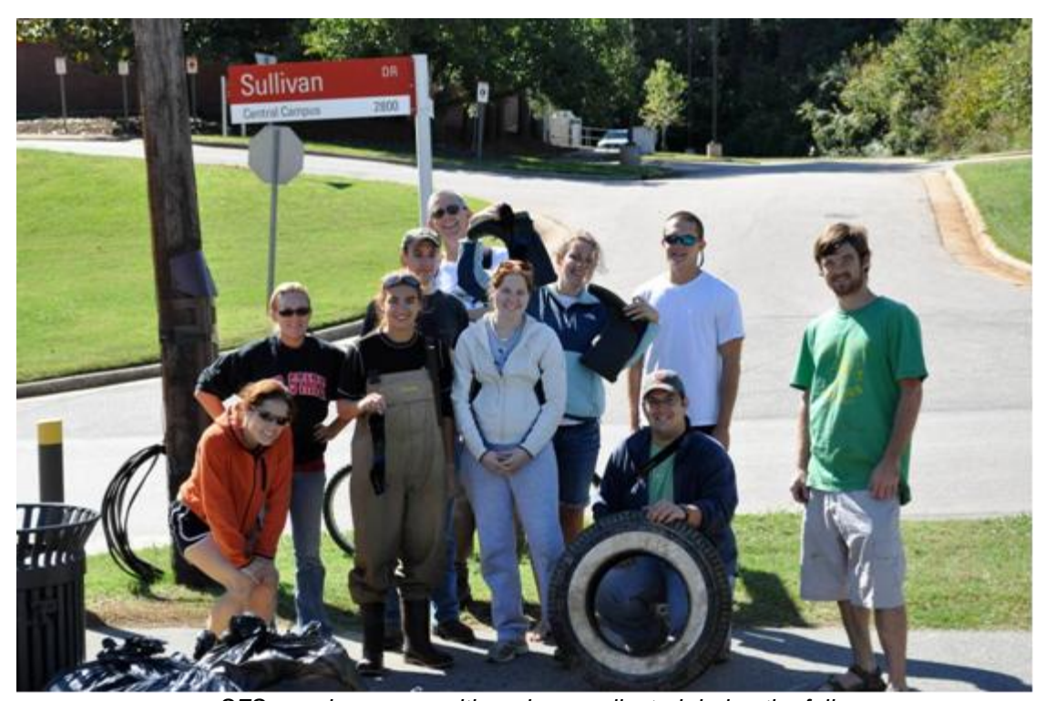
SFS members pose with garbage collected during the fall clean-up of Rocky Branch that flows through the NCSU campus.

visitors at the NC Seafood Festival in Morehead City. We also conducted the fall cleanup of our "adopted" Rocky Branch, resulting in quite a few bags of garbage and tennis balls (donated to a local dog park). We are currently writing aquatic science questions for an Envirothon trivia competition. Finally, members have been active volunteering at the NC State Fair and NC Museum of Natural Sciences.