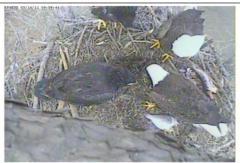
NCSU Eagle Cam photo of Bald Eagle parents with their fast-growing eaglet chicks in their nest on Jordan Lake, NC, 14 March 2011. Note the remains of their black crappie prey... or is that a bluegill?

The success of the Eagle Cam probably has you thinking of other more aquatic public outreach opportunities... what's next, the Trout Redd Cam, Crappie Trap-Net Cam, the Community Fishing Lake Attractor Cam, or maybe the Hatchery Raceway Cam? The possibilities are endless!