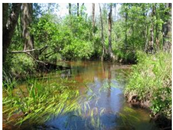
A typical Sand Hills stream, Horse Creek, Moore County.

Special Studies - Five Special Studies were conducted this field season - three for DENR's Ecosystem Enhancement Program (EEP) and two for the Modeling and Total Maximum Daily Load (TMDL) Unit. The EEP's mission is: "to restore, enhance, preserve, and protect the functions associated with wetlands, streams and riparian areas " (http://www.nceep.net/). Watersheds targeted for restoration or enhancement included those of Martin and Peachtree Creek in the Hiwassee River Basin, the Fishing Creek watershed (Granville County) in the Tar River Basin, and the upper Uwharrie River watershed in the Yadkin River Basin. The stressor studies conducted for the TMDL Unit focused on the Abbotts Creek watershed in Davidson County and several watersheds in Gaston and Lincoln counties in the Catawba River Basin. Summaries of these studies are currently available or will be available by the end of the year from Bryn Tracy and Jeff DeBerardinis.