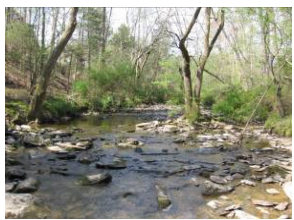
A typical Carolina Slate Belt stream, Stony Run, Stanly County.

beginning in early 2007. Preliminary results show some lingering drought impacts in the lower part of the basin, especially in some of the smaller streams draining the Carolina Slate Belt ecoregion. Encouragingly, good and excellent biological sites still existed throughout the Yadkin River Basin.