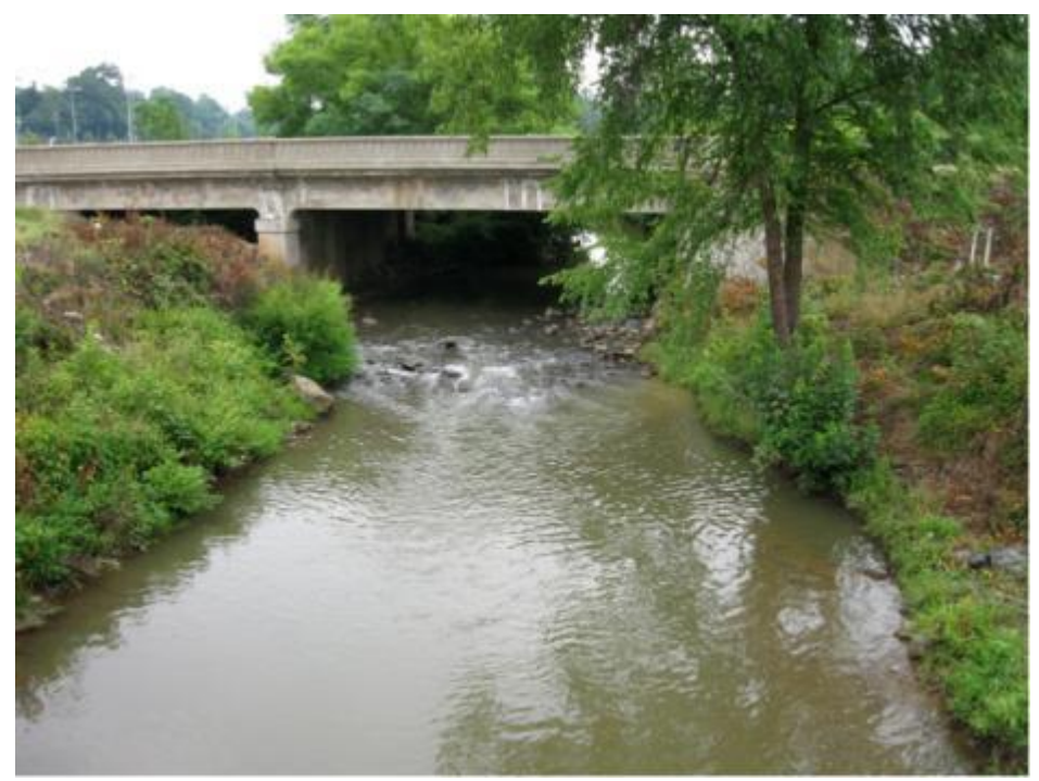
Figure 3. Salem Creek, looking upstream from the South Main Street bridge, City of Winston-Salem, Forsyth County. Riffle from which specimens of the Bluehead Chub were collected in July 2009 can be seen just downstream from the pedestrian walkway bridge.

Rosefin Shiner, Lythrurus ardens , and Flathead Catfish, Pylodictis olivaris (including a specimen ~ 850 mm TL).