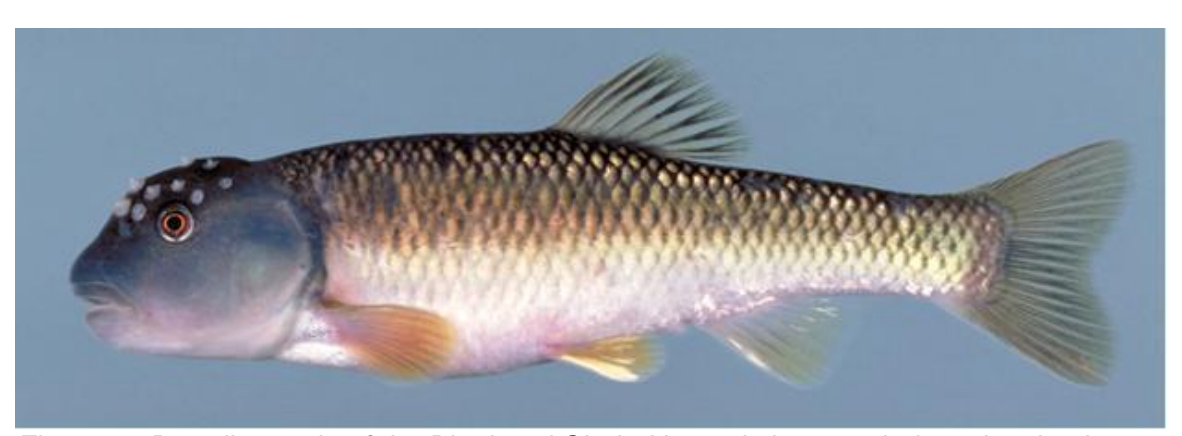
Figure 1. Breeding male of the Bluehead Chub, Nocomis leptocephalus, showing its characteristic swollen bluish head and white breeding tubercles atop its head.

The specimens were collected in the early 1850s (precise date unknown) by J. T. Lineback (correctly spelled Linebach), one of the founding families of the Moravian community of Salem in Forsyth County. Linebach was assisted by students from Salem Academy, a women's school in Salem which opened in 1772, and Salem College, the oldest women's college in the nation. Remarkable is the fact that the specimens were collected in the early 1850s by women, during a time when few women were afforded an education. Historically, when a species was first described the author often did not specify a type locality. A type locality is the place where the population occurs from