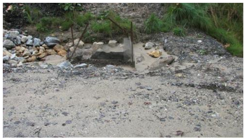
Failed sediment screen on a road cross drain inlet in the brook trout stream watershed, September 2009.

Unlike mining, there is no bonding requirement under sediment and erosion control programs. Consequently, there is no ready recourse for addressing failing sediment and erosion best management practices and unstable roadways.