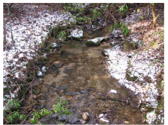
Brook trout stream in February 2007 during initial phase of residential subdivision road construction.

The return of rain and a soured real estate sector are taking a toll on some North Carolina trout streams. Since the drought, stream flows have increased and improved spawning habitat. However, erosion and sedimentation are increasing where road construction progress has stopped in some residential subdivisions. An example of this is shown below.