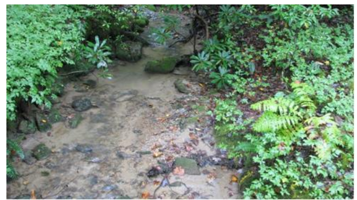
Same brook trout stream accumulating fine sediments in September 2009 after residential subdivision road construction ceases due to financial difficulties.