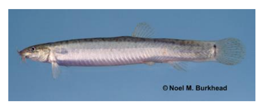
Figure 1. The Oriental Weatherfish, Misgurnus anguillicaudatus (Cantor 1842).

The specimens were found in slackwater pools and along the stream margins associated with silts, sands, and small woody debris. The Varnals and Haw creek sites are within 2.6 miles of one another, but the site on South Buffalo Creek is approximately 50-60 stream miles upstream (Figure 2). Separating the lower two sites from the upper site are four dams (three across the Haw River with two at Swepsonville and one at Altamahaw and a dam across Reddy Fork at Ossipee). It is thus likely that the three specimens represent two, widely separated introductions. However, it is not known if the species is established at any of the sites or is found at other sites within the Haw River system. Future surveying would be necessary to determine if the species is established at these locales and is dispersing into new streams throughout the upper Haw River system. Seven other non-indigenous species were collected from these three sites: Rosefin Shiner, Crescent Shiner, Fathead Minnow, Red Shiner, White Sucker, Green Sunfish, and Redear Sunfish. The specimens will be vouchered at the North Carolina State Museum of Natural Sciences (<a href="http://www.naturalsciences.org/research-collections/research-specialties/fishes">http://www.naturalsciences.org/research-collections/research-specialties/fishes</a>).