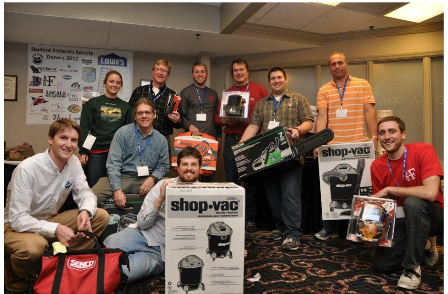
A few of the lucky winners of great prizes given away during the NCSU student raffle/auction.

With spring came the start of many field sessions and many more outreach activities. We participated with three water-body clean ups. Lake Raleigh on Centennial Campus of NCSU has become a pet project of our group for classes. We have noticed an accumulation of trash and helped clean up on a beautiful Saturday morning. We also organized a cleanup on another Saturday morning of our adopted section of Rocky Branch Creek on the Main Campus. Finally, we participated in our continued effort to help clean up the Neuse River.