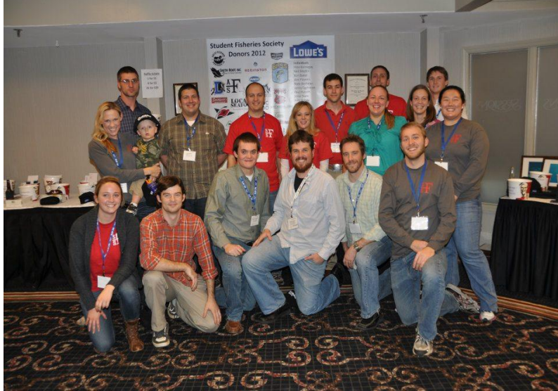
SFS dedicated members had a great. time making the student fundraiser a success