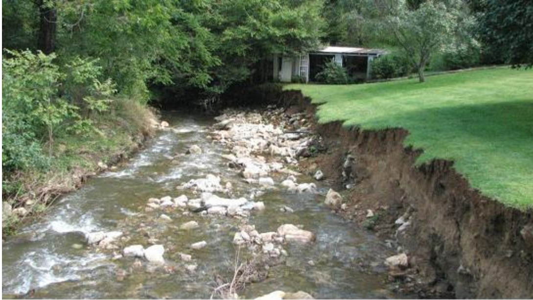
2010 flood damage in northwestern Yancey County

The issue of riparian vegetation and working along trout streams, or more specifically the “trout buffer rule”, recently received more attention in court. In 2009, the NC Appeals Court determined that the rule, which under the Sediment and Erosion Control Act requires the maintenance of undisturbed, vegetated buffers between land disturbing activities and trout classified waters, was errantly applied by NCDENR, Division of Land Resources to the Mountain Air golf course development in Yancey County (see December 2009 NCAFS newsletter). The N.C. Supreme Court overturned that ruling this year (see decision at http://www.aoc.state.nc.us/www/public/sc/opinions/2010/pdf/525A09-1.pdf ). It remains to be seen whether working along mountain trout streams will return to the status quo or with regulatory changes.