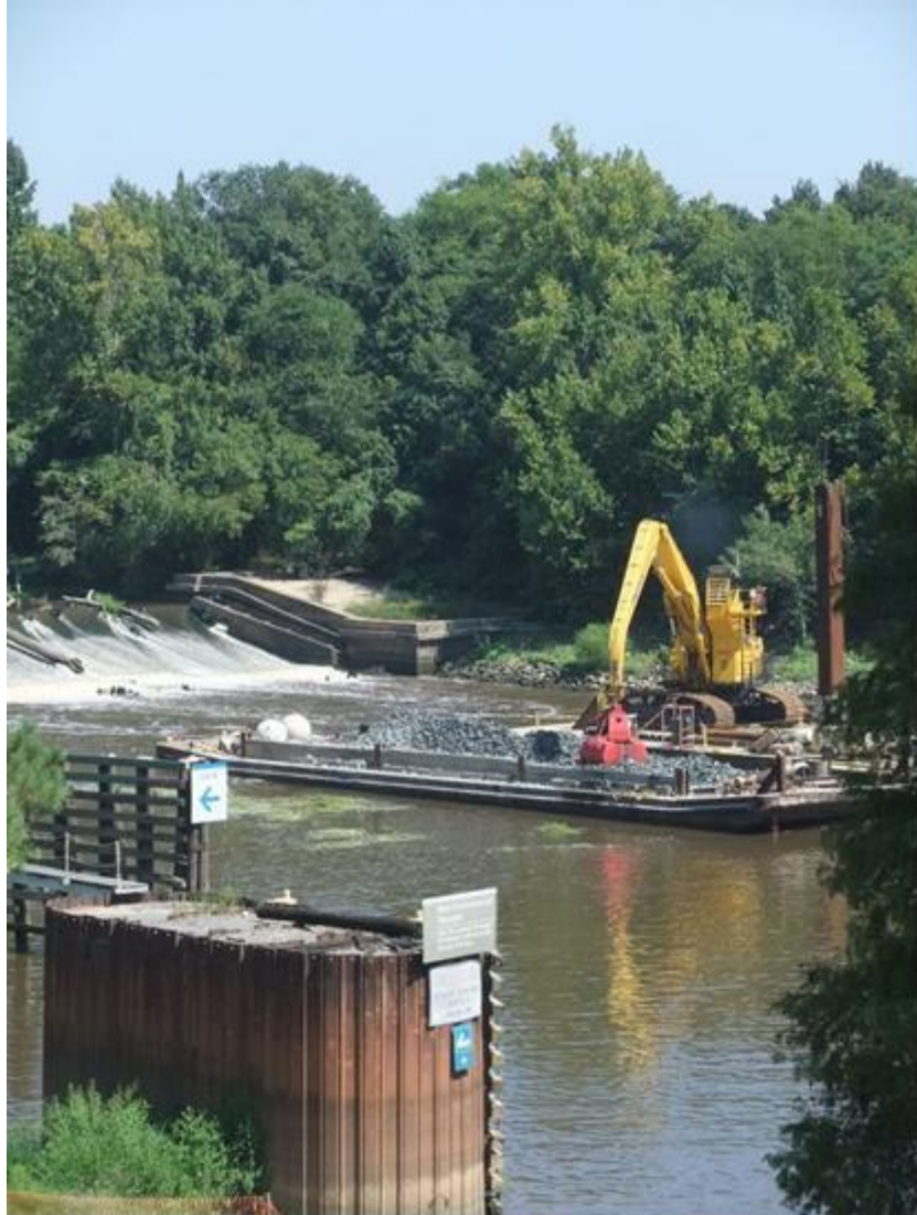
Scour hole filling below Cape Fear River Lock and Dam #1