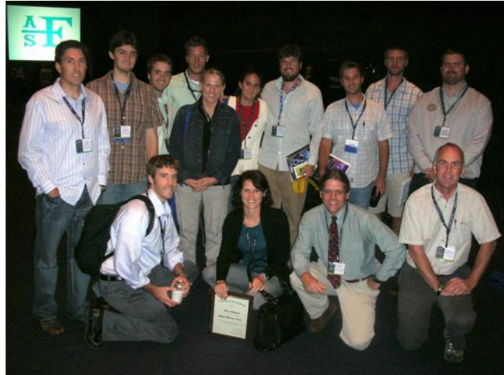
The NCSU and SFS crew at the 2010 AFS annual meeting in Pittsburgh, PA.