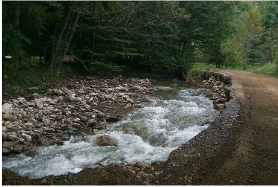
Creek bank damage after storms.