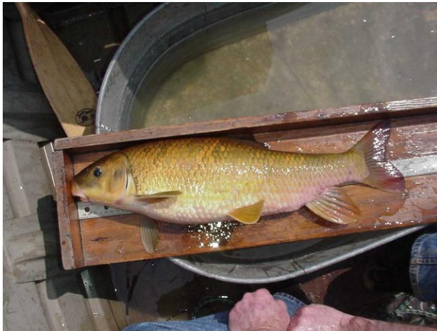
Robust redhorse ( Moxostoma robustum ) specimen collected from the Pee Dee River in North Carolina on 26 April 2000.

The robust redhorse is known to maintain populations in limited portions of the Oconee and Ocmulgee rivers, GA, and the Savannah River, GA-SC. The presence of this species in the Pee Dee River suggests other Atlantic slope drainages may hold populations of this species where it historically may have occurred. Future surveys of the Pee Dee River should help address questions of the distribution and abundance of this species in this river as well as insights into population structure and dynamics. Surveying the Pee Dee River and other Atlantic slope rivers is a research priority outlined by the Robust Redhorse Conservation Committee, a consortium of state and federal agencies, environmental organizations, and power utility companies that has been involved in conservation efforts regarding the robust redhorse since its initial re-discovery in the Oconee River in Georgia during 1991.