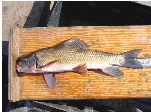
Adult Carolina redhorse (481 mm TL, 1250 grams weight) collected on the Pee Dee River near Cheraw, SC, on May 6, 2002.

Survey efforts by participating agencies have found four robust redhorse in the Pee Dee River during the period of 2000-2002. Two of the specimens have been adult females, located in the Fall Line zone of the river in North Carolina while two juveniles have been collected in the South Carolina Coastal Plain region of the river. Prior to these individuals, only two other robust redhorse have been collected from the Yadkin-Pee Dee River.