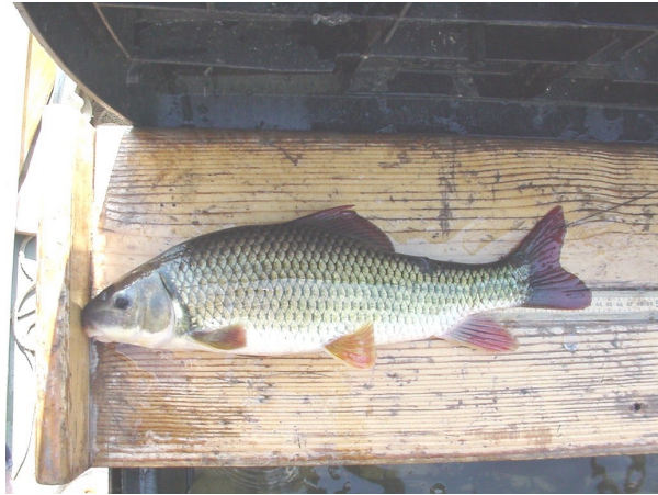
Juvenile robust redhorse (430 mm TL, 1125 grams weight, 3 years of age) collected on the Pee Dee River, South Carolina, May 10, 2002.

Society Hill while the two Carolina redhorses were collected near Cheraw, SC, and the other Carolina redhorse was collected just below the Blewett Dam in North Carolina.