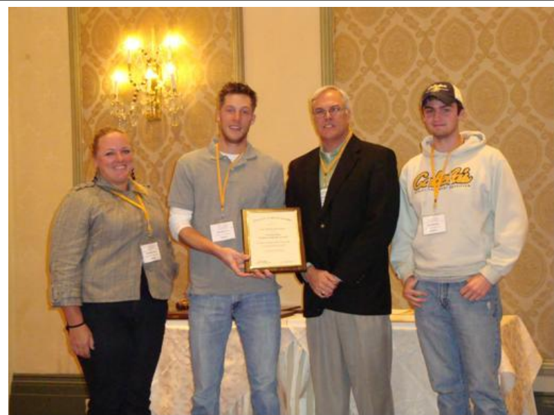
Several subunit members accepted the AFS best student subunit award at the Southern Division AFS Meeting in New Orleans, LA.